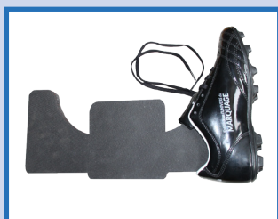
Plate for shoes

This interchangeable below plate allows an easy customization of all kind of shoes. It is available as an option for all Red Promatex International tee-shirt presses. It has a marking area of 5 x 10 cm which can be put at the side, the heel or the strip of the shoes.