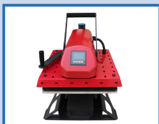
TS-3838MER 38 x 38 cm format

Its large lower plate provides a better visibility for the logos or tee-shirts positioning, and allows A3 format marking and turns easy the application of texts with numbers in one step.