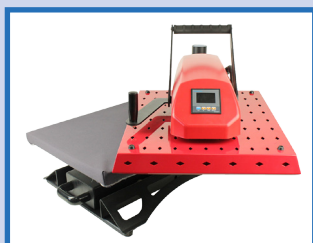
TS-4050MER 40 x 50 cm format